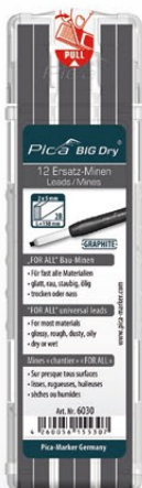
6030 FOR ALL universal graphite leads For almost all materials.