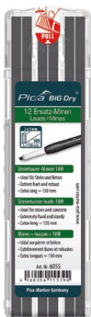
6055 Stonemason leads 10H Ideal for stone and concrete. Extremely hard and sturdy.