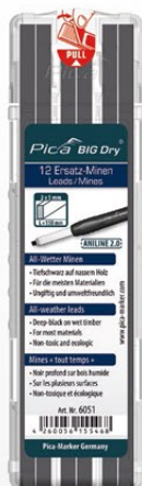
6051 ANILINE 2.0 "All-weather leads" Deep-black application on wet timber.