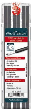
6050 Carpenter leads For dry timber.