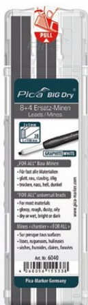
6040 FOR ALL universal leads Graphite + White 8 Graphite leads + 4 white leads. For almost all materials.